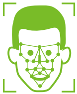
Access Control System

Our Pro series tripod turnstiles represent classic and safe way to protect your premises. They are used in various indoor environment applications. They fit perfectly as an economical option in the office buildings and other related applications.